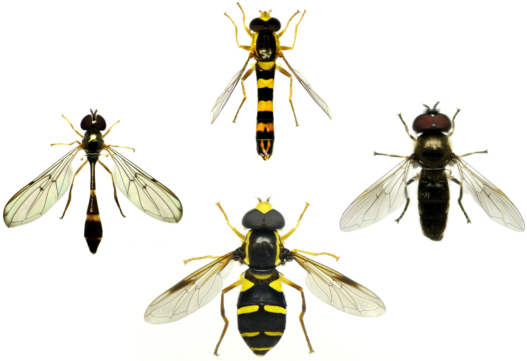
Greenfly gourmands Gourmands de pucerons